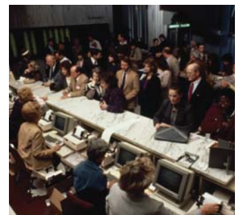
Market registration, 1984