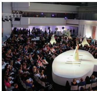
Atlanta Apparel Market Atrium Fashion Show, 2015