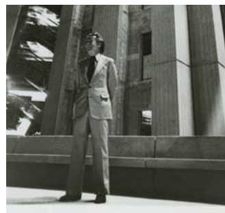
John C. Portman, Jr., Atlanta Apparel Market, 1979