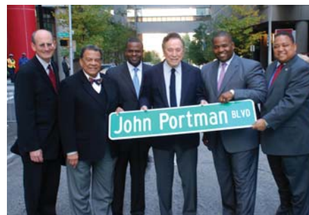
John Portman Boulevard Dedication, 2011