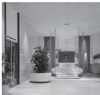
Building 1 lobby, 1961