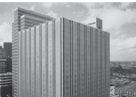
Original Atlanta Merchandise Mart Building, 1961

Atlanta Gift Mart (AmericasMart Building 2) opens. 18 stories built on 5-story parking garage.